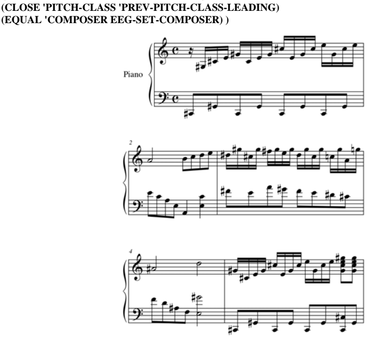
Figure 2. An example of a generated mixture of Robert Schumann and Ludwig van Beethoven.

Assuming that there are also musical elements available from composers other than SCHU , the first constraint will limit the options to all incipient measures from all musical elements from all composers. The second constraint will then limit the options according to the current EEG analysis to the composer that is associated with the current EEG activity, as follows: